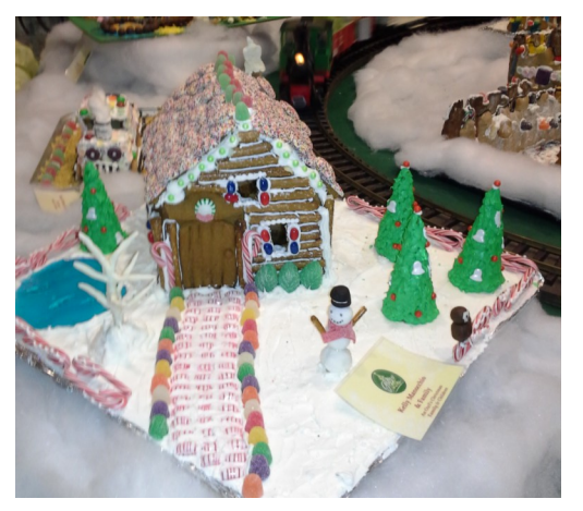
Manocchio Gingerbread House